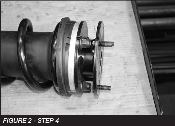
FIGURE 2 - STEP 4