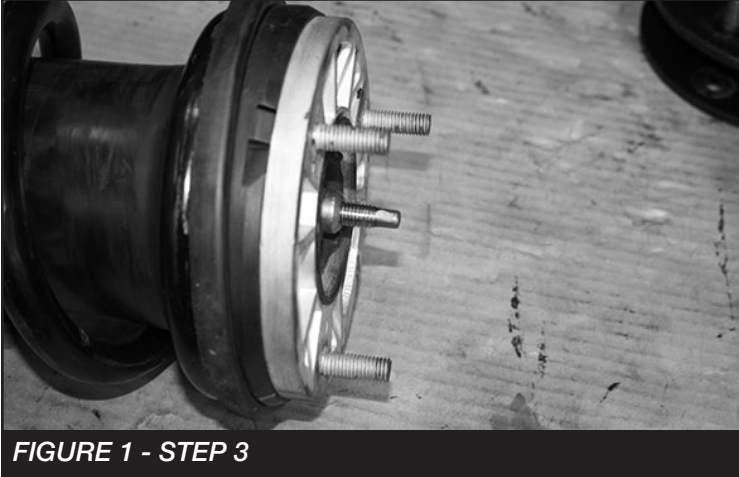
FIGURE 1 - STEP 3