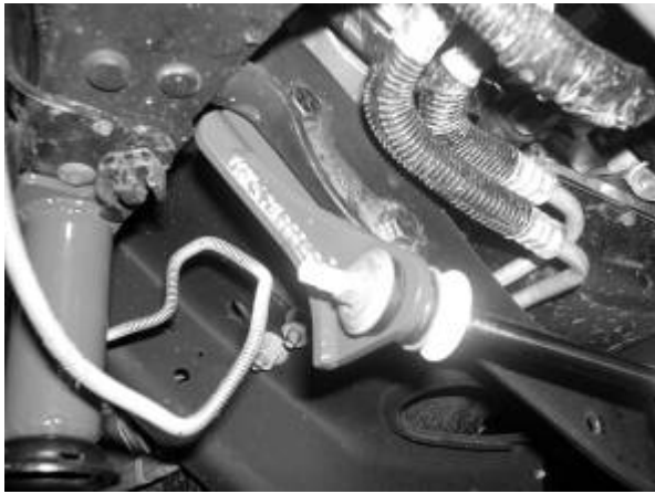
Picture Shown With Stabilizer Installed