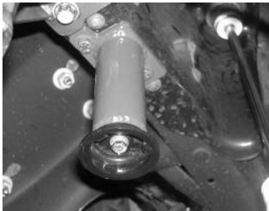
photo shown without bump installed 17. Using the coil springs from the 6" lift or 8" lift coil spring kit install the coil spring into the truck in the factory location using the original factory upper coil isolator. IF INSTALLING A FABTECH COILOVER CONVERSION KIT SEE THE INSTRUCTIONS ENCLOSED WITH THE HOOP KIT AT THIS TIME.

16. Working from both sides of the truck, locate and remove the factory front bump stops and save. These can be removed by pulling on the bump stop itself free from the cup. Remove the factory mounting cup from the frame and discard the hardware. Locate FT30143 and FT30144 front bump stop drop brackets. Using a drill with a 7/16" drill bit, drill out the factory locator pin hole in the frame. Now attach the bump stop to the hole in the frame using the supplied 7/16" x 1 1/2" bolt, nut, and washer. Once attached and aligned with the frame drill the second hole with the 7/16" drill bit. Attach the last hole with the supplied 7/16" x 1 1/2" hardware. Attach the factory bump stop cup to the new bracket using the supplied 5/16" x 1 1/4" bolt, flat washer, and split washer. Press the factory bump stop back into the cup. SEE PHOTO BELOW.