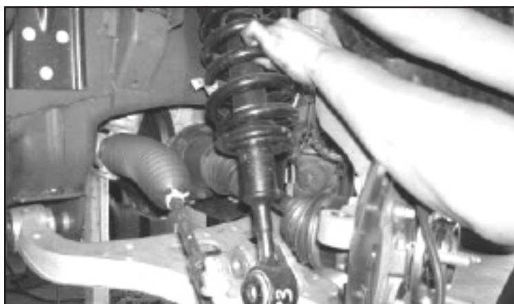
FIGURE 2 - STEP 4