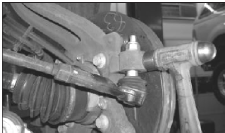
FIGURE 1 - STEP 3