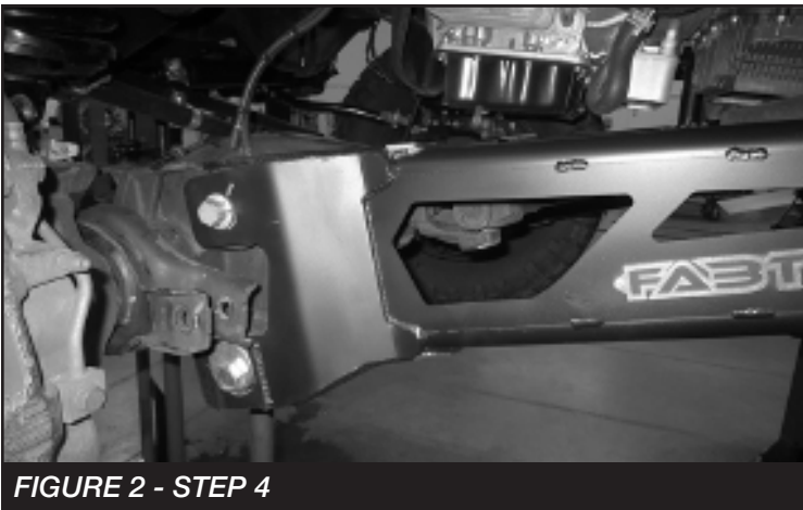
FIGURE 2 - STEP 4