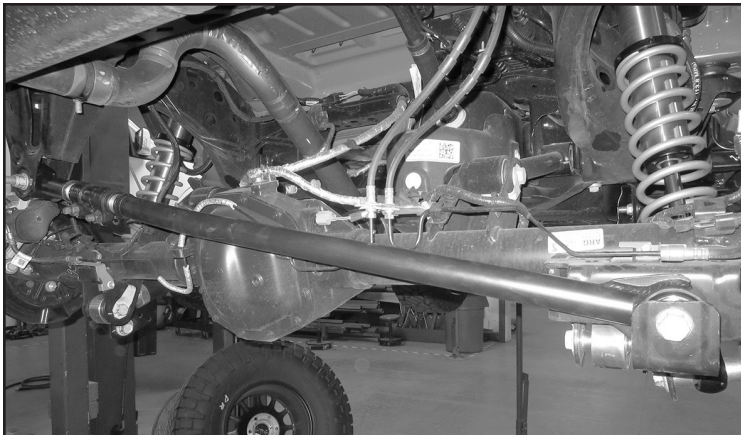
FIGURE 2 - STEP 4