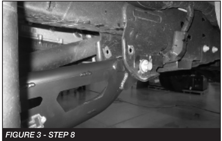
FIGURE 3 - STEP 8