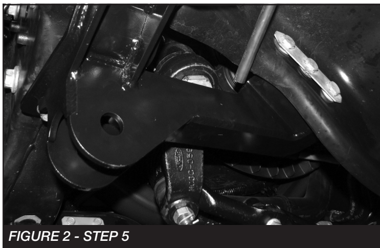
FIGURE 2 - STEP 5