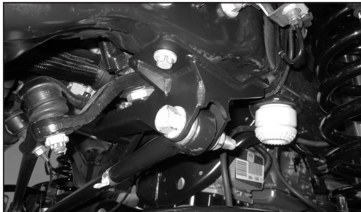
FIGURE 6 - STEP 10