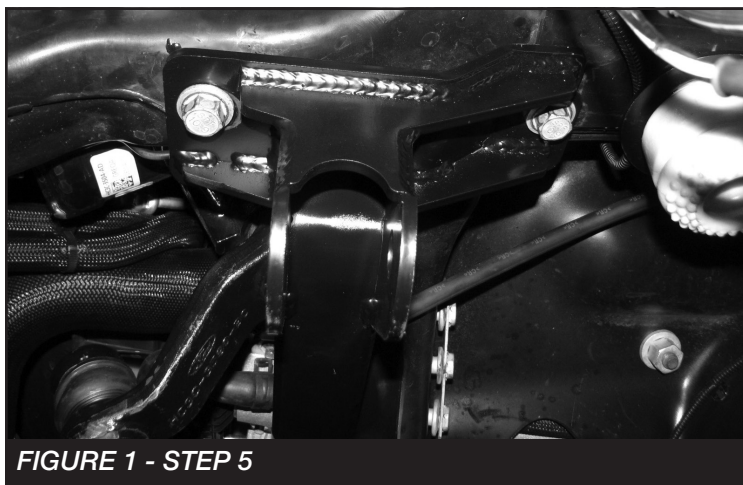
FIGURE 1 - STEP 5