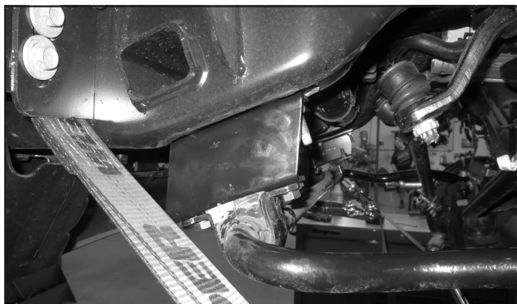
FIGURE 7 - STEP 11