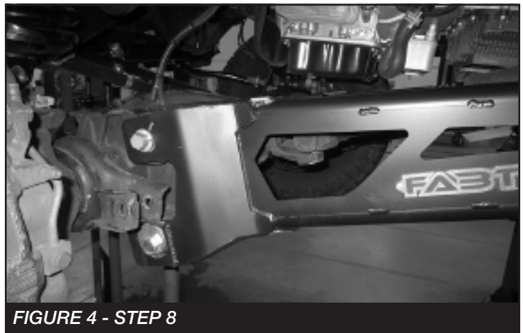
FIGURE 4 - STEP 8