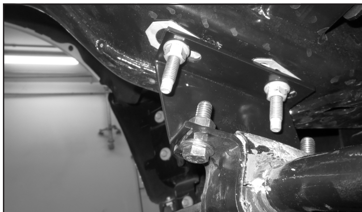
FIGURE 8 - STEP 11