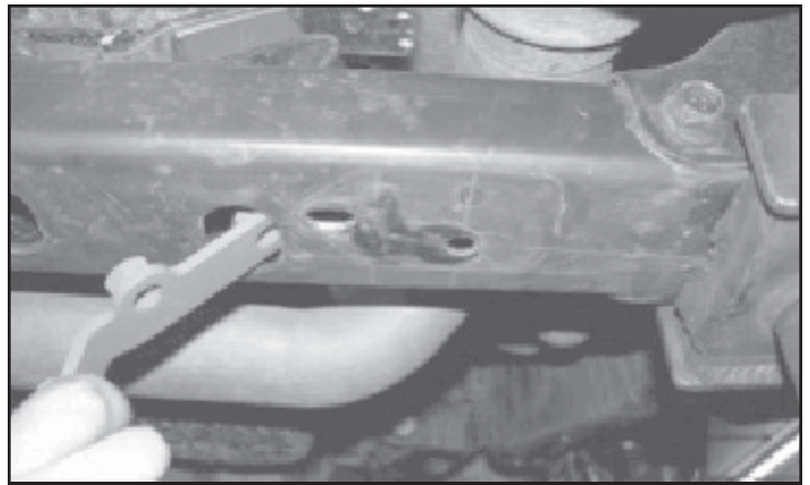
FIGURE 2 - STEP 7