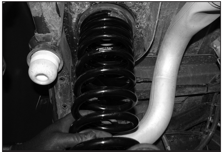
FIGURE 2 - STEP 11