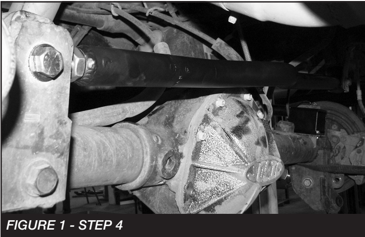
FIGURE 1 - STEP 4