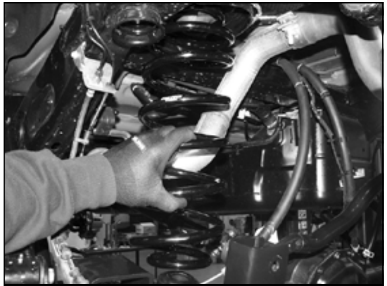
FIGURE 2 - STEP 10