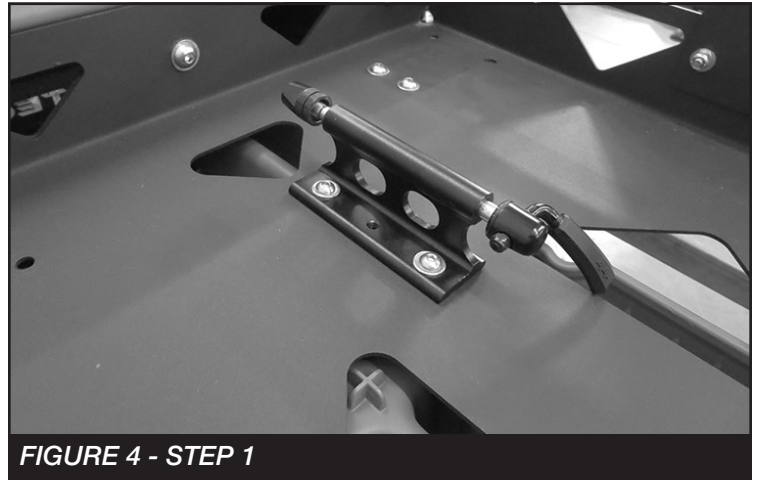
FIGURE 4 - STEP 1

For technical assistance call: 909-597-7800