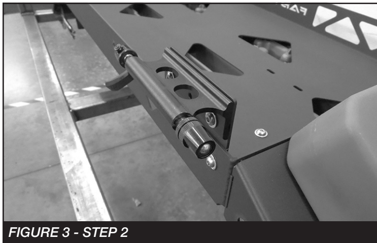
FIGURE 3 - STEP 2