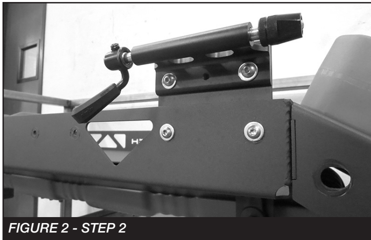
FIGURE 2 - STEP 2