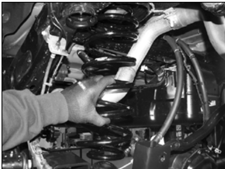
FIGURE 2 - STEP 10