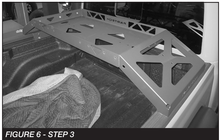
FIGURE 6 - STEP 3