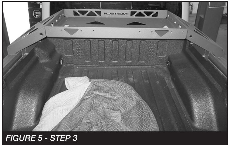
FIGURE 5 - STEP 3