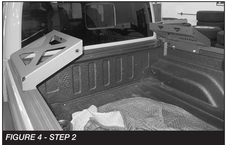
FIGURE 4 - STEP 2