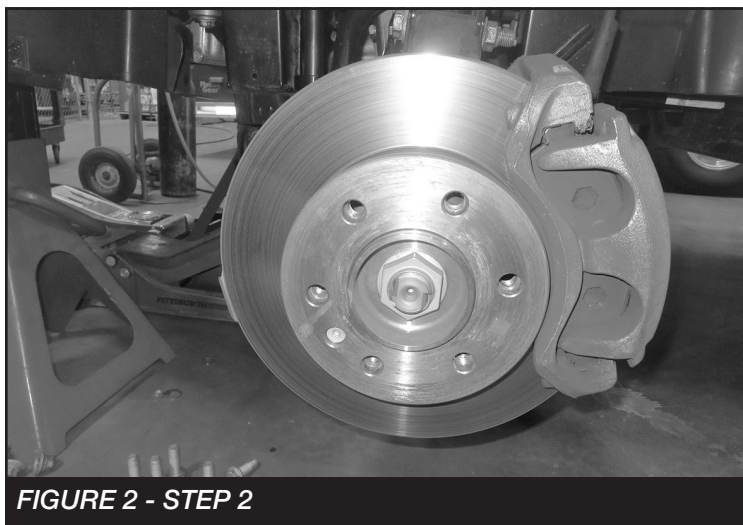
FIGURE 2 - STEP 2