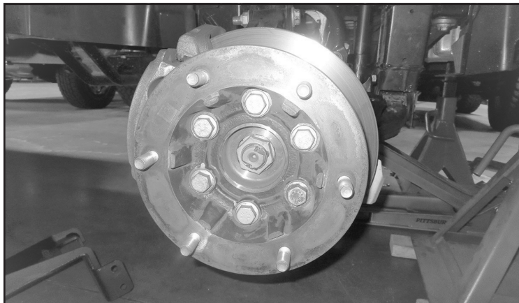
FIGURE 1 - STEP 2