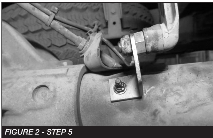
FIGURE 2 - STEP 5