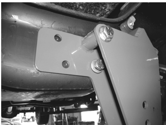
Driver Side I-beam Bracket Ft410-104 Viewed from the front