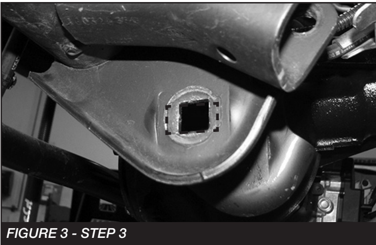
FIGURE 3 - STEP 3