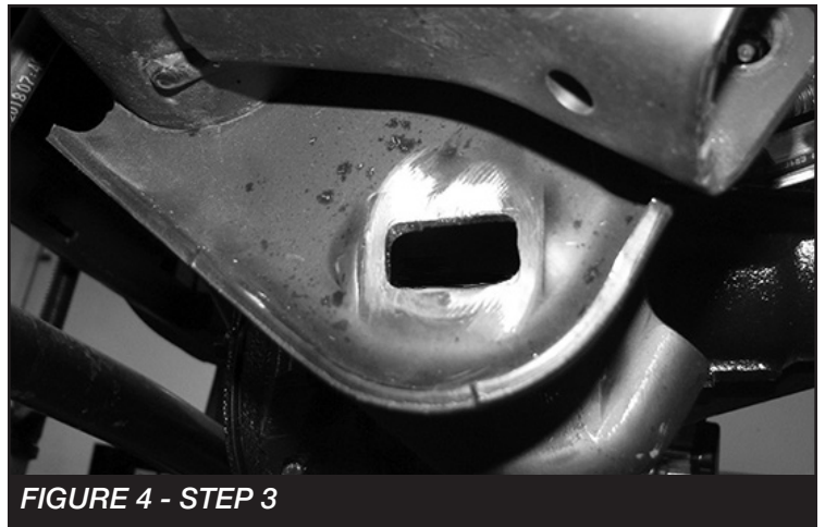
FIGURE 4 - STEP 3