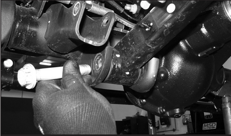
FIGURE 1 - STEP 2