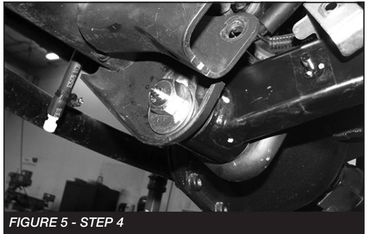
FIGURE 5 - STEP 4