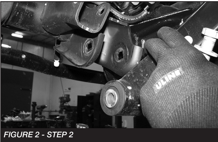
FIGURE 2 - STEP 2