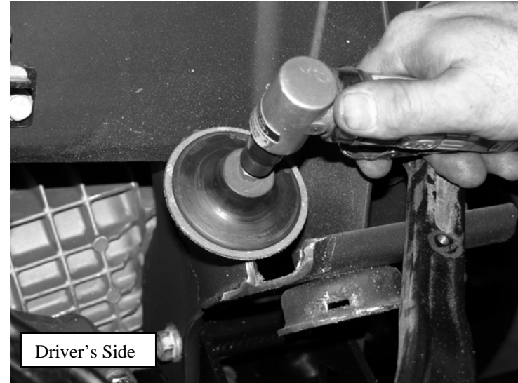
Sand cut area to a smooth surface.