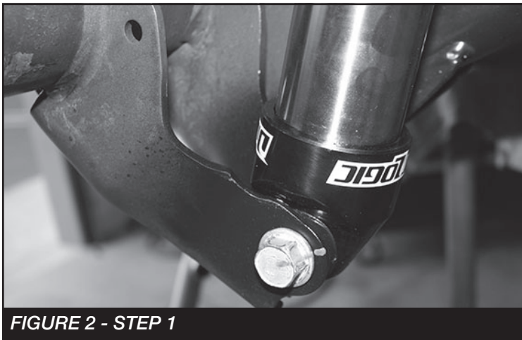
FIGURE 2 - STEP 1

RETORQUE ALL NUTS, BOLTS AND LUGS AFTER 50 MILES AND PERIODICALLY THEREAFTER.