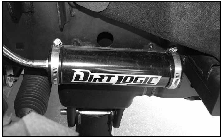
FIGURE 3 - STEP 4