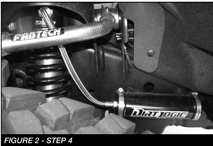
FIGURE 2 - STEP 4