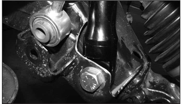
FIGURE 4 - STEP 3