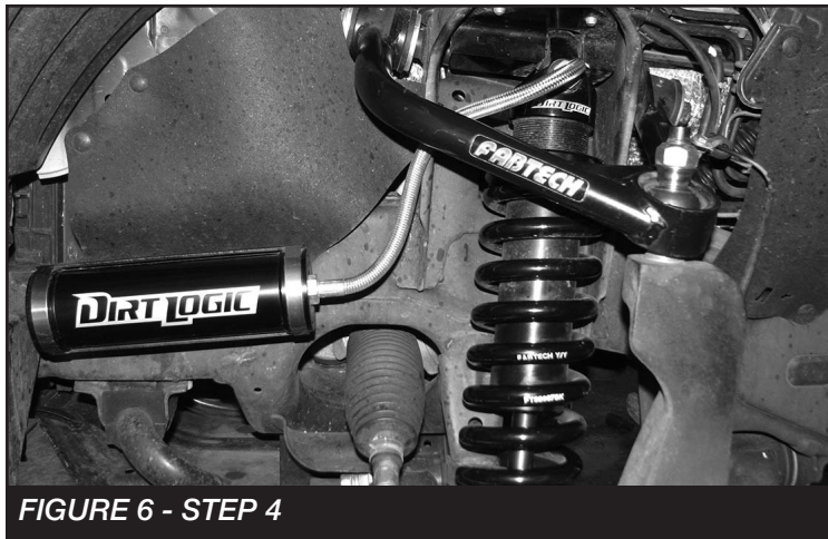
FIGURE 6 - STEP 4