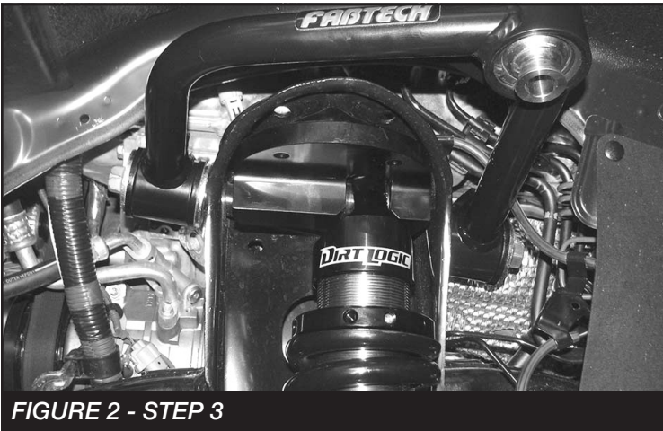
FIGURE 2 - STEP 3