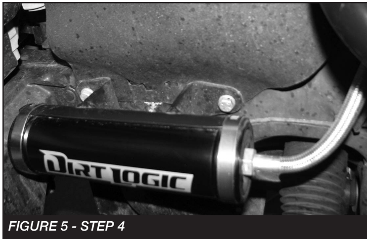
FIGURE 5 - STEP 4