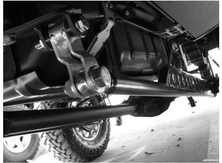
FRONT OF TRUCK FACING THE REAR