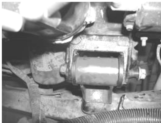
Pass. Side Motor Mount Shown