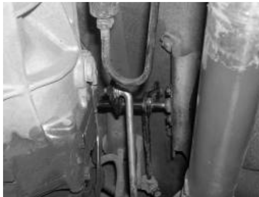
View from front of truck looking back.