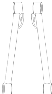
Driver Side End Link FT50069