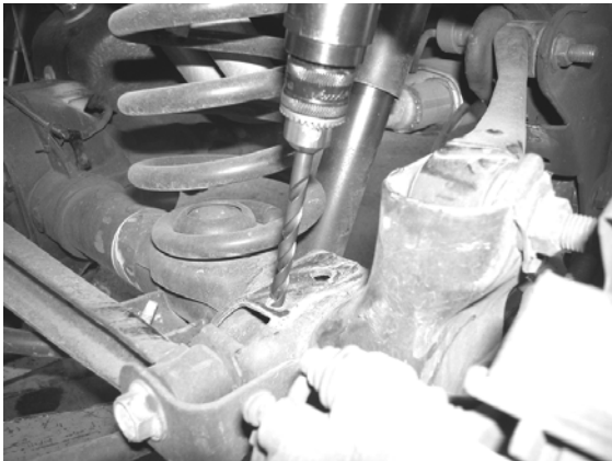
Drill factory hole out to 7/16."