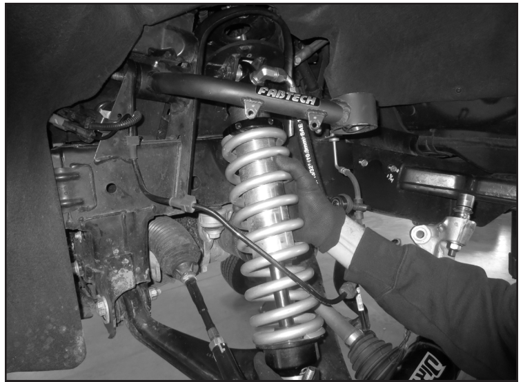
FIGURE 3 - STEP 3