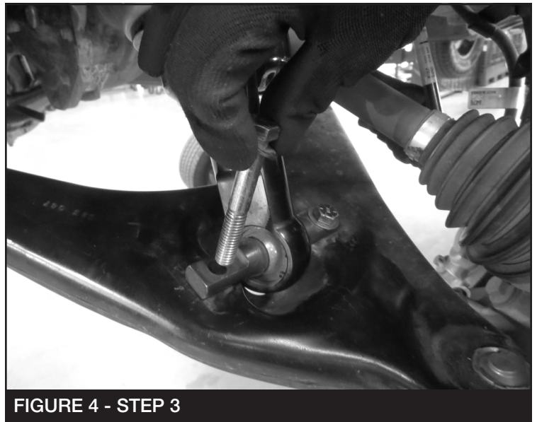
FIGURE 4 - STEP 3