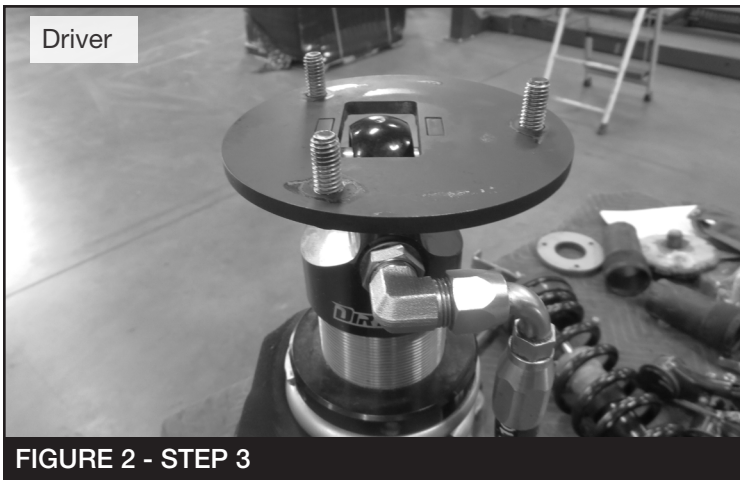
FIGURE 2 - STEP 3