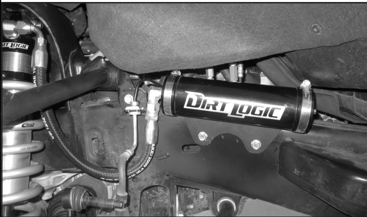
FIGURE 6 - STEP 5