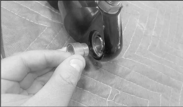
FIGURE 1 - STEP 1